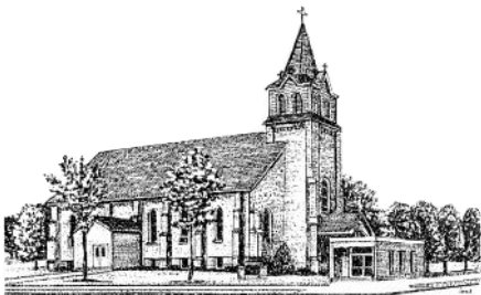
ST. MICHAEL – Suring