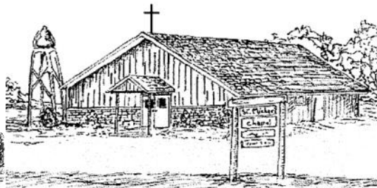
ST. MICHAEL STATION – Chute Pond