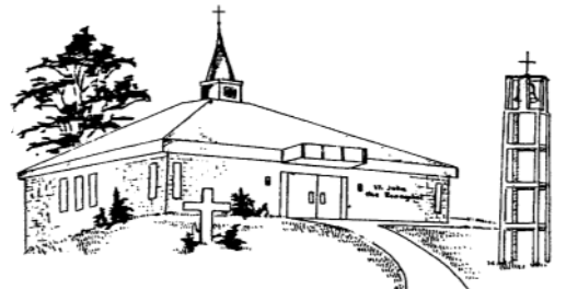
ST. JOHN THE EVANGELIST – Gillett