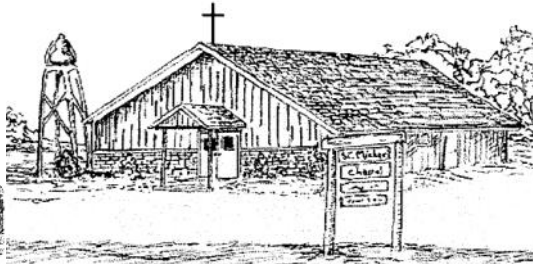
ST. MICHAEL STATION – Chute Pond