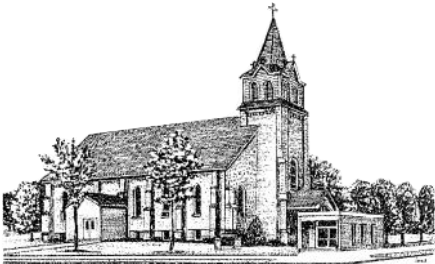
ST. MICHAEL – Suring