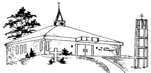
ST. JOHN THE EVANGELIST – Gillett