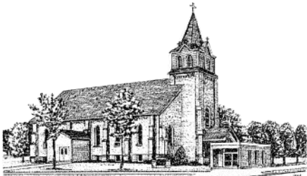
ST. MICHAEL – Suring