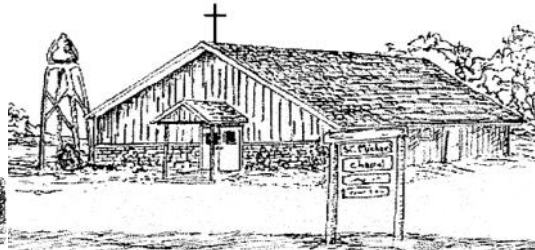
ST. MICHAEL STATION – Chute Pond