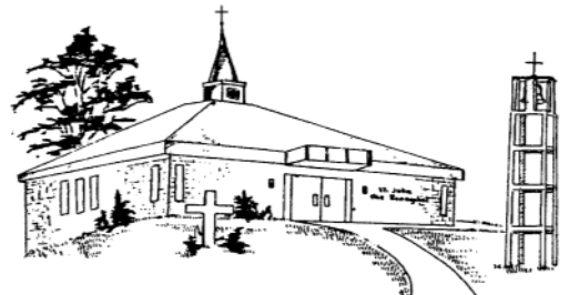
ST. JOHN THE EVANGELIST – Gillett