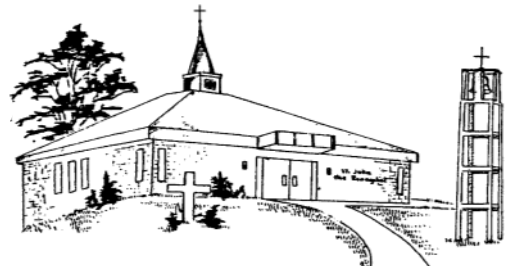
ST. JOHN THE EVANGELIST – Gillett