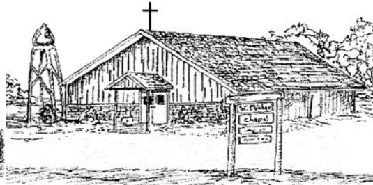
ST. MICHAEL STATION – Chute Pond