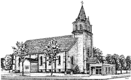
ST. MICHAEL – Suring