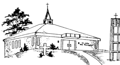
ST. JOHN THE EVANGELIST – Gillett