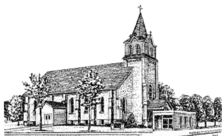
ST. MICHAEL – Suring