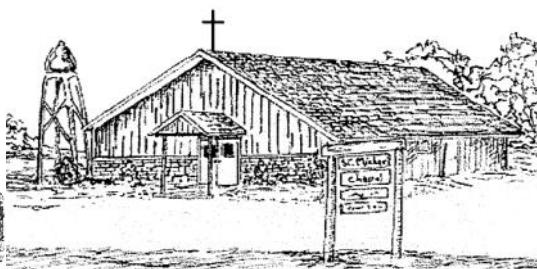
ST. MICHAEL STATION – Chute Pond