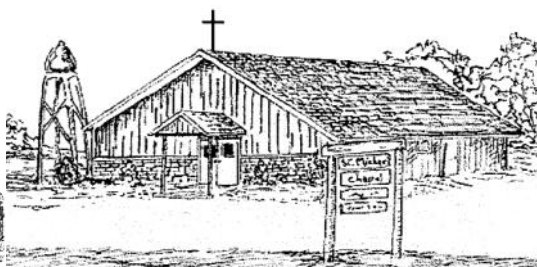
ST. MICHAEL STATION – Chute Pond