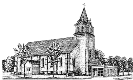
ST. MICHAEL – Suring