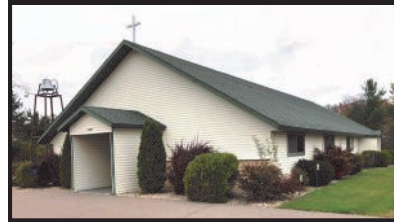
ST. MICHAEL STATION - Chute Pond

Mass Times: Sunday, 8:45 AM Wednesday, 8:30 AM