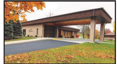
ST. JOHN THE EVANGELIST - Gillett

Mass Times: Saturday, 4:00 PM Sunday, 10:00 AM Tuesday, 8:30 AM Spanish Mass, 3rd Saturday, 6:30 PM