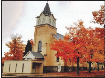
ST. MICHAEL - Suring

Mass Times: Sunday, 8:45 AM Wednesday, 8:30 AM