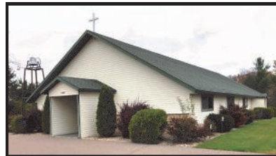
ST. MICHAEL STATION - Chute Pond

Mass Times: Sunday, 8:45 AM Wednesday, 8:30 AM