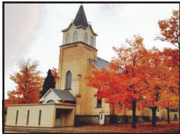
ST. MICHAEL - Suring

Mass Times: Sunday, 8:45 AM Wednesday, 8:30 AM