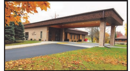
ST. JOHN THE EVANGELIST - Gillett

Mass Times: Saturday, 4:00 PM Sunday, 10:00 AM Tuesday, 8:30 AM Spanish Mass, 3rd Saturday, 6:30 PM