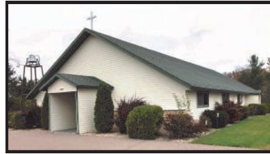
ST. MICHAEL STATION - Chute Pond

Mass Times: Sunday, 8:45 AM Wednesday, 8:30 AM