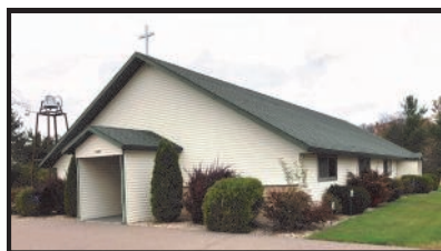
ST. MICHAEL CHAPEL - Chute Pond

Mass Times: Sunday, 8:45 AM Wednesday, 8:30 AM