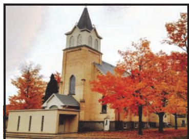
ST. MICHAEL - Suring

Mass Times: Sunday, 8:45 AM Wednesday, 8:30 AM