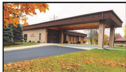
ST. JOHN THE EVANGELIST - Gillett

Mass Times: Saturday, 4:00 PM Sunday, 10:00 AM Tuesday, 8:30 AM