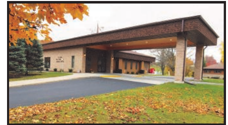
ST. JOHN THE EVANGELIST - Gillett

Mass Times: Saturday, 4:00 PM Sunday, 10:00 AM Tuesday, 8:30 AM