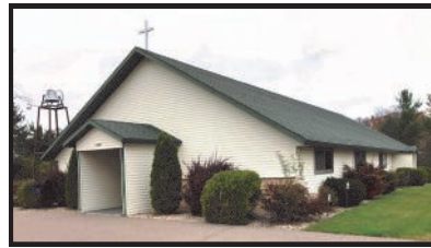
ST. MICHAEL CHAPEL - Chute Pond

Mass Times: Sunday, 8:45 AM Wednesday, 8:30 AM