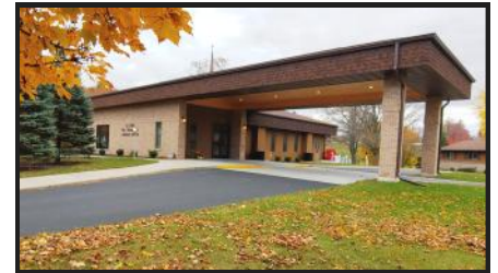
ST. JOHN THE EVANGELIST - Gillett

Mass Times: Saturday, 4:00 PM Sunday, 10:00 AM Tuesday, 8:30 AM