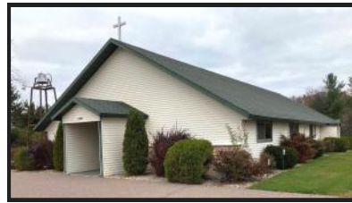
ST. MICHAEL STATION - Chute Pond

Mass Times: Sunday, 8:45 AM Wednesday, 8:30 AM