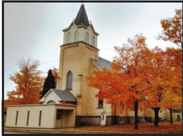
ST. MICHAEL - Suring

Mass Times: Sunday, 8:45 AM Wednesday, 8:30 AM