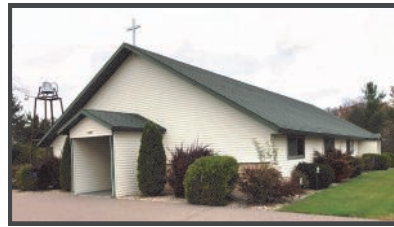
ST. MICHAEL CHAPEL- Chute Pond

Mass Times: Sunday, 8:45 AM Wednesday, 8:30 AM