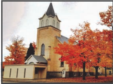
ST. MICHAEL - Suring

Mass Times: Sunday, 8:45 AM Wednesday, 8:30 AM