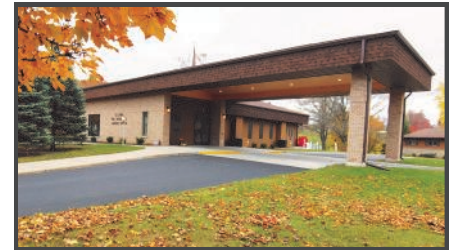
ST. JOHN THE EVANGELIST - Gillett

Mass Times: Saturday, 4:00 PM Sunday, 10:15 AM Tuesday, 8:30 AM