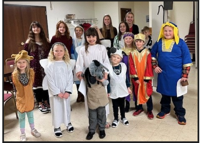
St. John Faith Formation students presented their Christmas program at Mass, to the delight of all!