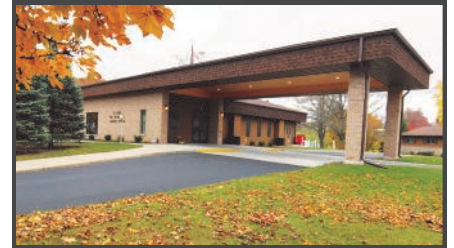
ST. JOHN THE EVANGELIST - Gillett

Mass Times: Saturday, 4:00 PM Sunday, 10:15 AM Tuesday, 8:30 AM