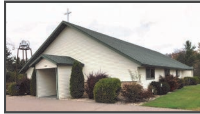
ST. MICHAEL CHAPEL- Chute Pond

Mass Times: Sunday, 8:45 AM Wednesday, 8:30 AM