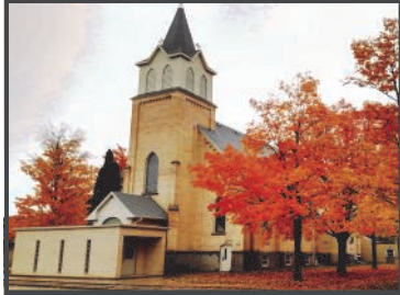
ST. MICHAEL - Suring

Mass Times: Sunday, 8:45 AM Wednesday, 8:30 AM