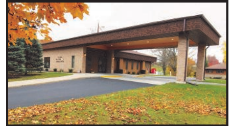
ST. JOHN THE EVANGELIST - Gillett

Mass Times: Saturday, 4:00 PM Sunday, 10:00 AM Tuesday, 8:30 AM