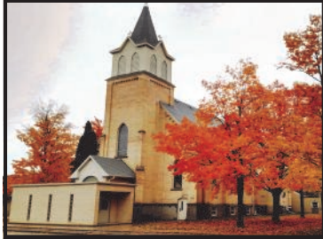
ST. MICHAEL - Suring

Mass Times: Sunday, 8:45 AM Wednesday, 8:30 AM