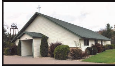
ST. MICHAEL CHAPEL - Chute Pond

Mass Times: Sunday, 8:45 AM Wednesday, 8:30 AM