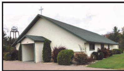
ST. MICHAEL CHAPEL - Chute Pond

Mass Times: Sunday, 8:45 AM Wednesday, 8:30 AM