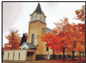
ST. MICHAEL - Suring

Mass Times: Sunday, 8:45 AM Wednesday, 8:30 AM