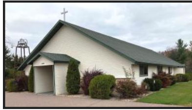
ST. MICHAEL CHAPEL- Chute Pond

Mass Times: Sunday, 8:45 AM Wednesday, 8:30 AM