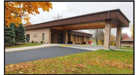
ST. JOHN THE EVANGELIST - Gillett

Mass Times: Saturday, 4:00 PM Sunday, 10:15 AM Tuesday, 8:30 AM