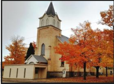
ST. MICHAEL - Suring

Mass Times: Sunday, 8:45 AM Wednesday, 8:30 AM