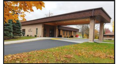
ST. JOHN THE EVANGELIST - Gillett

Mass Times: Saturday, 4:00 PM Sunday, 10:15 AM Tuesday, 8:30 AM