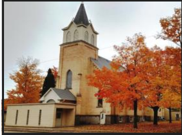
ST. MICHAEL - Suring

Mass Times: Sunday, 8:45 AM Wednesday, 8:30 AM