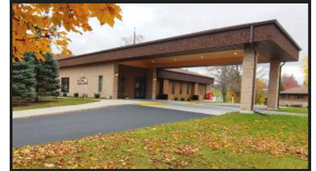
ST. JOHN THE EVANGELIST - Gillett

Mass Times: Saturday, 4:00 PM Sunday, 10:15 AM Tuesday, 8:30 AM