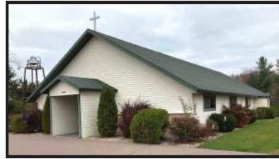
ST. MICHAEL CHAPEL- Chute Pond

Mass Times: Sunday, 8:45 AM Wednesday, 8:30 AM