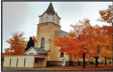
ST. MICHAEL - Suring

Mass Times: Sunday, 8:45 AM Wednesday, 8:30 AM 2nd & 4th Fri., 8:30 AM