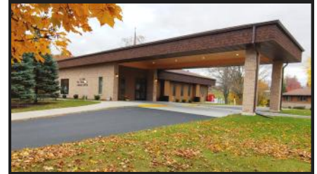
ST. JOHN THE EVANGELIST - Gillett

Mass Times: Saturday, 4:00 PM Sunday, 10:15 AM Tuesday, 8:30 AM 1st, 3rd, & 5th Fri., 8:30 AM