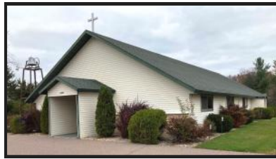
ST. MICHAEL CHAPEL- Chute Pond

Mass Times: Sunday, 8:45 AM Wednesday, 8:30 AM 2nd & 4th Fri., 8:30 AM