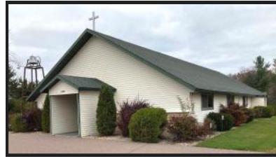
ST. MICHAEL CHAPEL- Chute Pond

Mass Times: Sunday, 8:45 AM Wednesday, 8:30 AM 2nd & 4th Fri., 8:30 AM