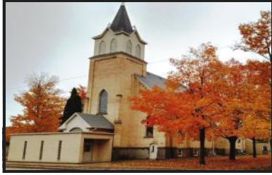
ST. MICHAEL - Suring

Mass Times: Sunday, 8:45 AM Wednesday, 8:30 AM 2nd & 4th Fri., 8:30 AM