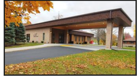
ST. JOHN THE EVANGELIST - Gillett

Mass Times: Saturday, 4:00 PM Sunday, 10:15 AM Tuesday, 8:30 AM 1st, 3rd, & 5th Fri., 8:30 AM