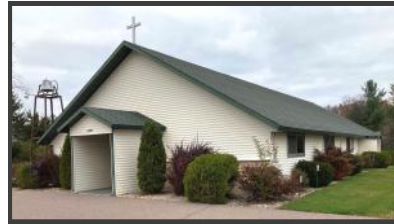
ST. MICHAEL CHAPEL- Chute Pond

Mass Times: Sunday, 8:45 AM Wednesday, 8:30 AM 2nd & 4th Fri., 8:30 AM