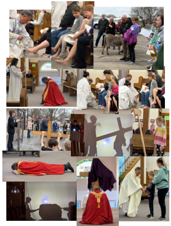
St. John & St. Michael Holy Week Celebrations