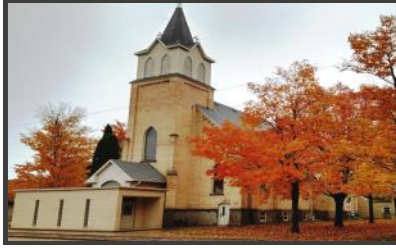
ST. MICHAEL - Suring

Mass Times: Sunday, 8:45 AM Wednesday, 8:30 AM 2nd & 4th Fri., 8:30 AM