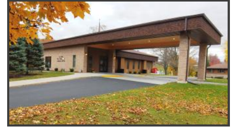
ST. JOHN THE EVANGELIST - Gillett

Mass Times: Saturday, 4:00 PM Sunday, 10:15 AM Tuesday, 8:30 AM 1st, 3rd, & 5th Fri., 8:30 AM