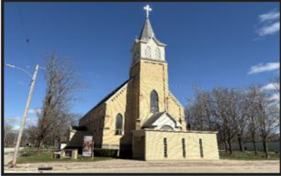
ST. MICHAEL - Suring

Mass Times: Sunday, 8:45 AM Wednesday, 8:30 AM 2nd & 4th Fri., 8:30 AM